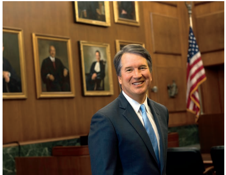
Hon. Brett M. Kavanaugh

Second, for the most part, presidents must and do follow the statutes regulating the war effort. There are occasional attempts by presidents to claim an exclusive power to conduct some national security action, even in the face of a congressional prohibition. But those